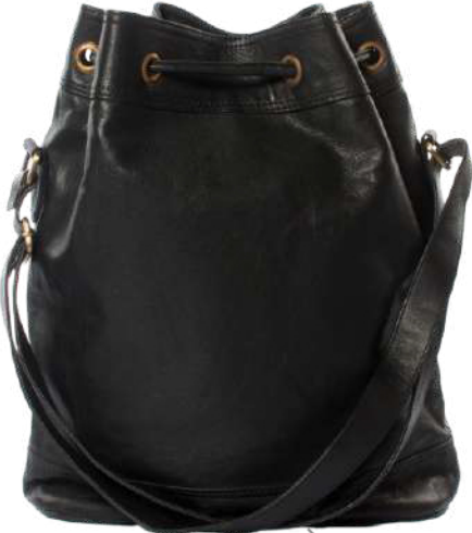
Classic Top-Grain Leather