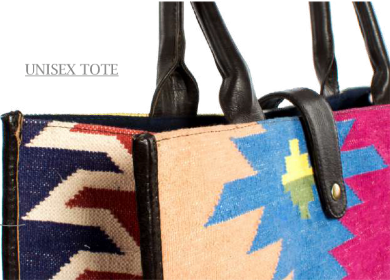
100% Handwoven Flatweave Dhurrie