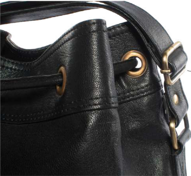
Imported antique-finished accessories